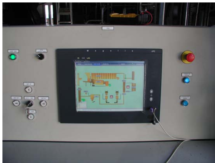
BIR 125 : 300 kg/h, Singapore + Dry scrubber