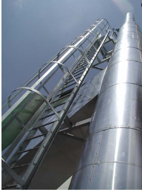
BIR 125 : 300 kg/h, Singapore + Dry scrubber