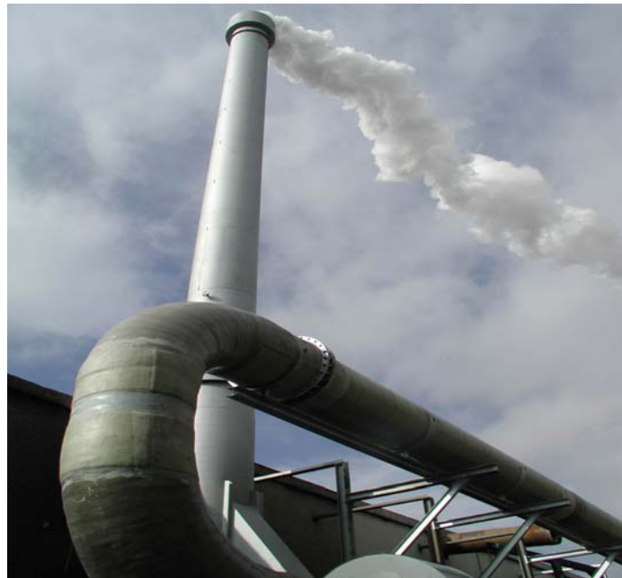
BIR 250 : 2 x 600 kg/h, Belgium + Wet scrubber