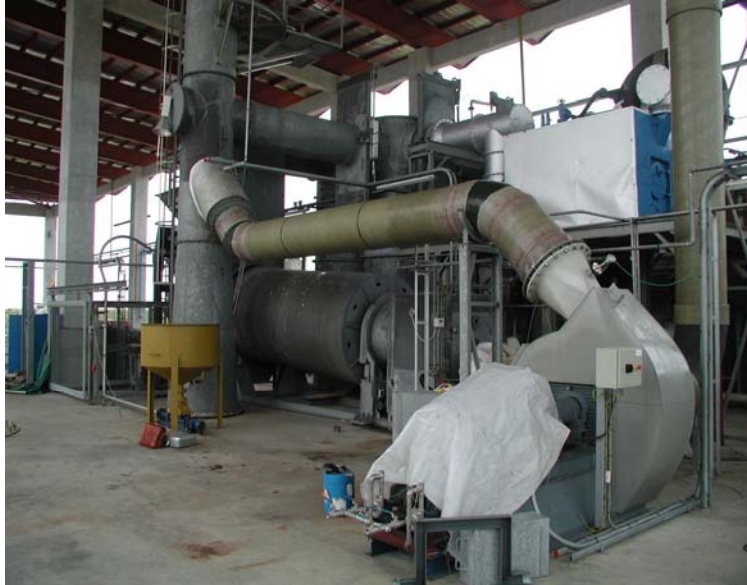
BIR 375 : 900 kg/h, Singapore + Wet scrubber