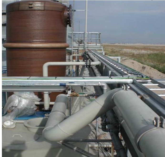
BIR 375 : 900 kg/h, Singapore + Wet scrubber