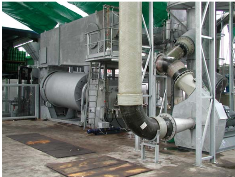
BIR 125 : 300 kg/h, Singapore + Wet scrubber